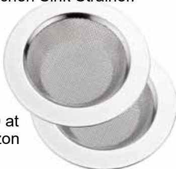
$7.50 at Amazon

To protect our drains, consider a stainless Kitchen Sink Strainer.