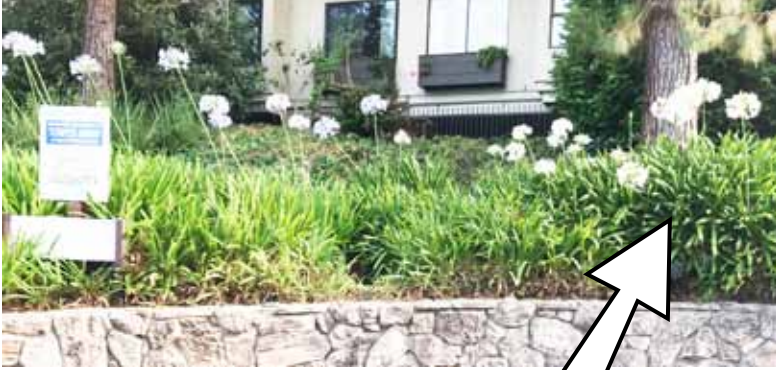
Location: View from MC entry, below Bldg A and tree.

In case of flooding by sprinklers, shut off water to all irrigation at Menlo Commons.