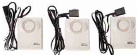
3-pack, $23 at Amazon

To detect flooding, consider a Water Leakage Detection Alarm. Under kitchen sink, under vanity, corner of bathroom floor.